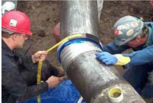
Using the narrow Velcro strips supplied in the kit, the torque bar strap is attached to the sleeve and tightened per installation procedure. Be careful not to over torque and pull the sleeve from the Anchor Pad.