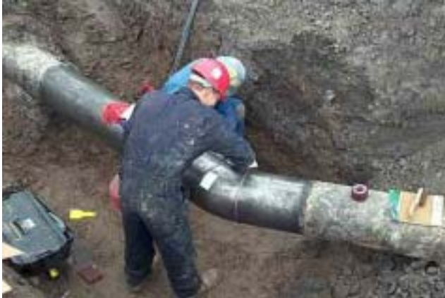
Each PermaWrap sleeve is cut, mitered to fit, and numbered at WrapMaster's facility. Prior to application, the individual PermaWrap sleeves are dry fitted and taped into position and checked for proper fit.