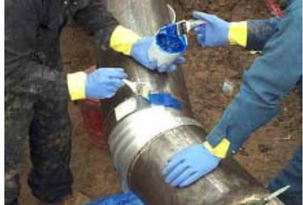
The Anchor Pad, PermaPutty Filler and PermaGrip Adhesive are then applied per Installation Procedure.