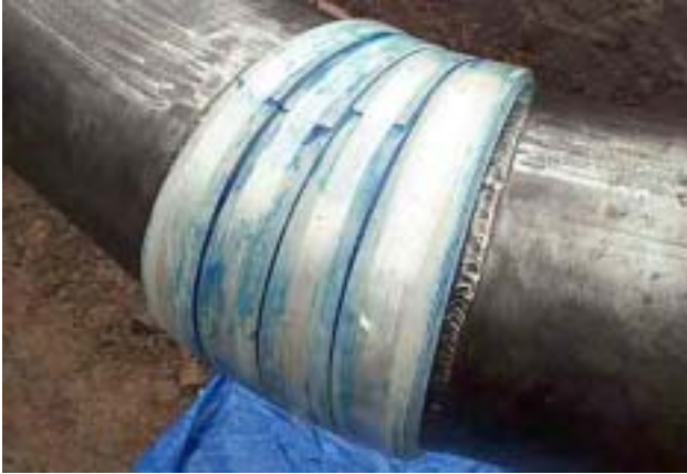
Using a clean rag, wipe the excess adhesive from the bend repair sleeves. A rag with a small amount of solvent may be used to assist cleanup. If repairing corrosion near the girth weld, apply a PermaWrap sleeve butted to the other side of the girth weld, using the traditional girth weld repair procedure.