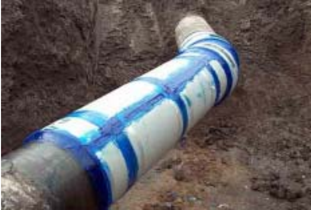
In the photo above, several PermaWrap sleeves were butted end-to-end to reinforce an area of general corrosion.