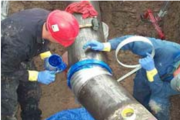
The protective backing is removed from the Anchor Pad. The sleeve is then attached to the Anchor Pad and applied to the pipe per standard installation procedure.