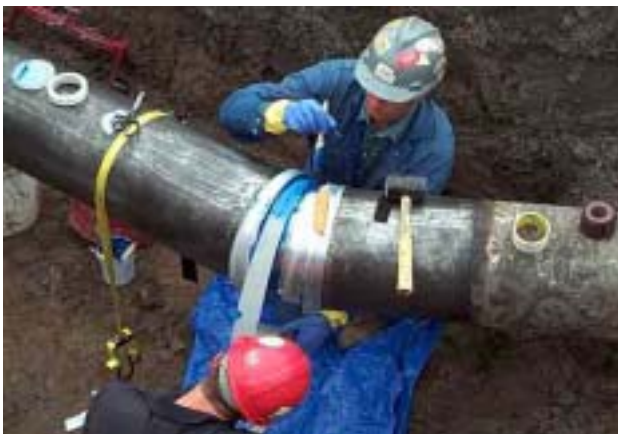
The excess PermaGrip adhesive and PermaPutty are removed from both edges of the installed sleeve. Using the same procedure, the remaining numbered sleeves are then applied.