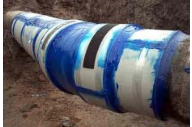
The photo above shows the completed bend repair area. As mentioned above, notice the P12-6 (12x6) PermaWrap sleeves installed over the girth weld for reinforcement.