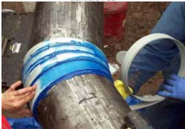
Upon completion of the last numbered PermaWrap sleeve, remove all the excess PermaPutty filler and PermaGrip adhesive.